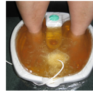
After 10 Min