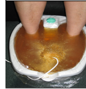
After 20 Min