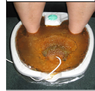
After 30 Min

Dark-field studies have shown that Ion Detox Foot Spa machine improves oxygen levels.